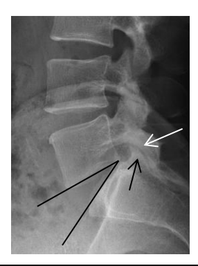
Increased 5<sup>th</sup> lumbar/sacrum angle, jamming the facet joints. (Facet Syndrome)

This x-ray shows a 5<sup>th</sup> lumbar vertebra extending too far backward and causing a jammed joint between the 5<sup>th</sup> lumbar and the sacrum (facet syndrome – white arrow). This renders the joint susceptible to inflammation , pain , and degeneration ( arthritis ). This 38 year old male is already exhibiting early calcium buildup along the joint surfaces in response to the stress that facet syndrome causes (arthritis - black arrow).